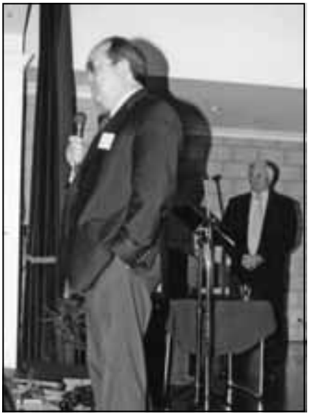
Senator Andrew Murray

Senator Andrew Murray addressed the group about the Australian Government's response to "Lost Innocents – Righting the Record" – where the experiences of the men and women who came to Australia as child migrants was recounted. Senator Murray was full of praise C-BERS' role in supporting this group of people.